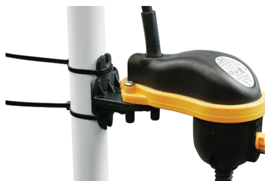
21866 | IMAGE 1