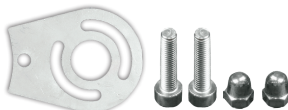
22382 | IMAGE 2